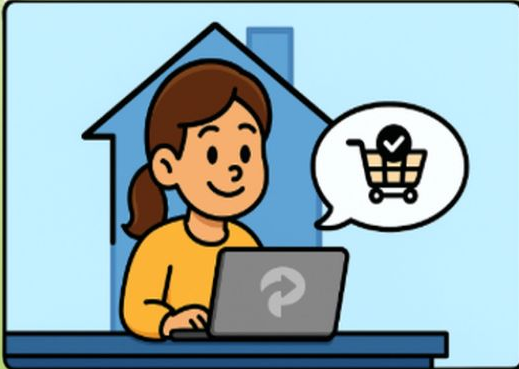
SECURE, 24/7 PLATFORM