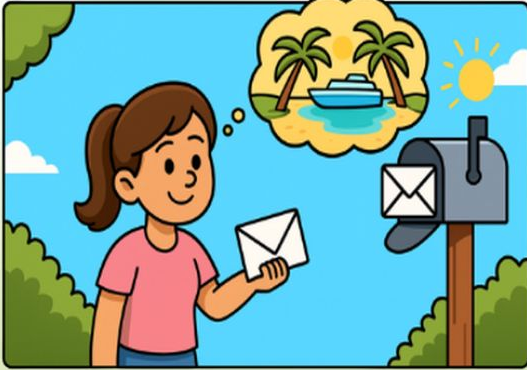
OUTDATED, PAPER-BASED SYSTEM