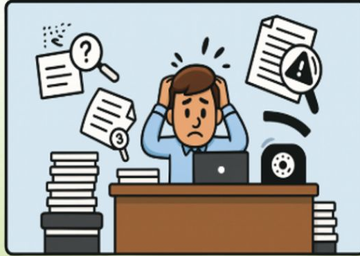
SLOW & INEFFICIENT PROCESS