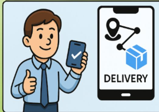
QUICK, CLEAR, RELIABLE PROCESS